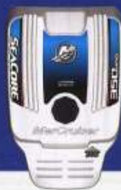
SEACORE 350 MAG