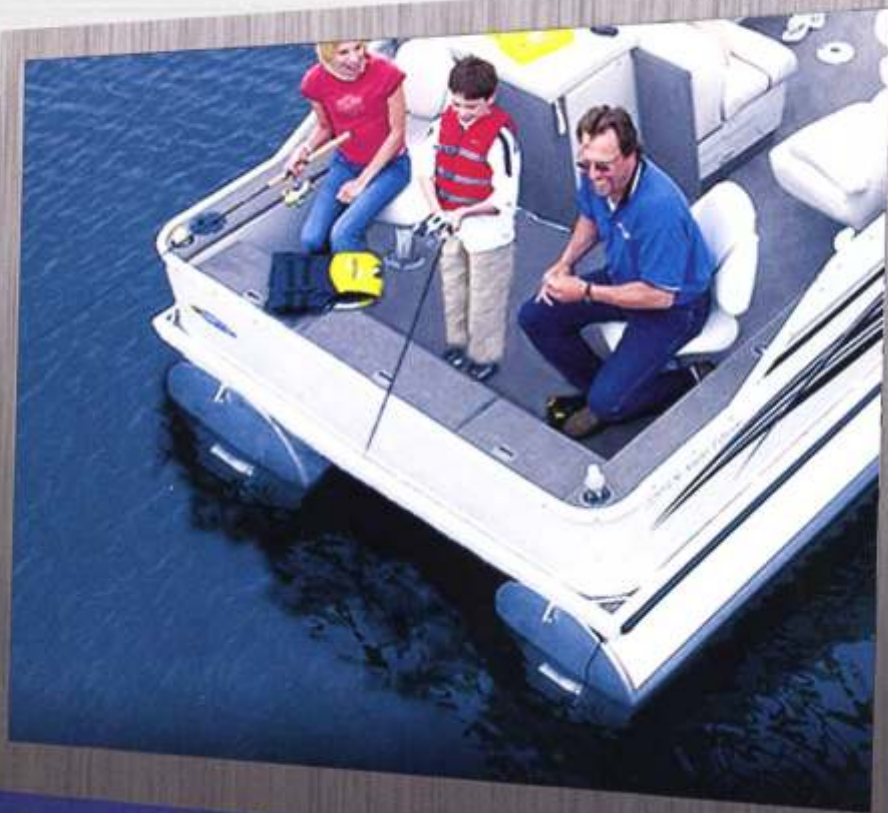
Same pontoon with the all-new MerCruiser Vazer.