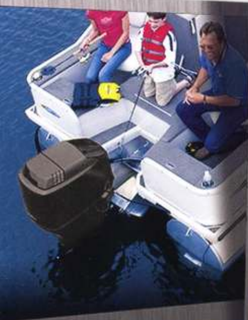
Typical pontoon with traditional outboard engine power.