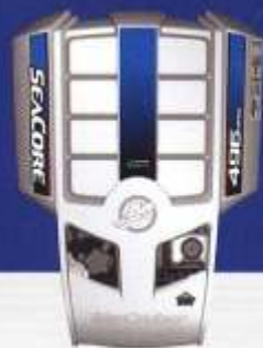
SEACORE 496 MAG