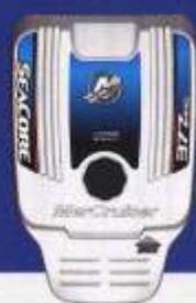
SEACORE 377 MAG